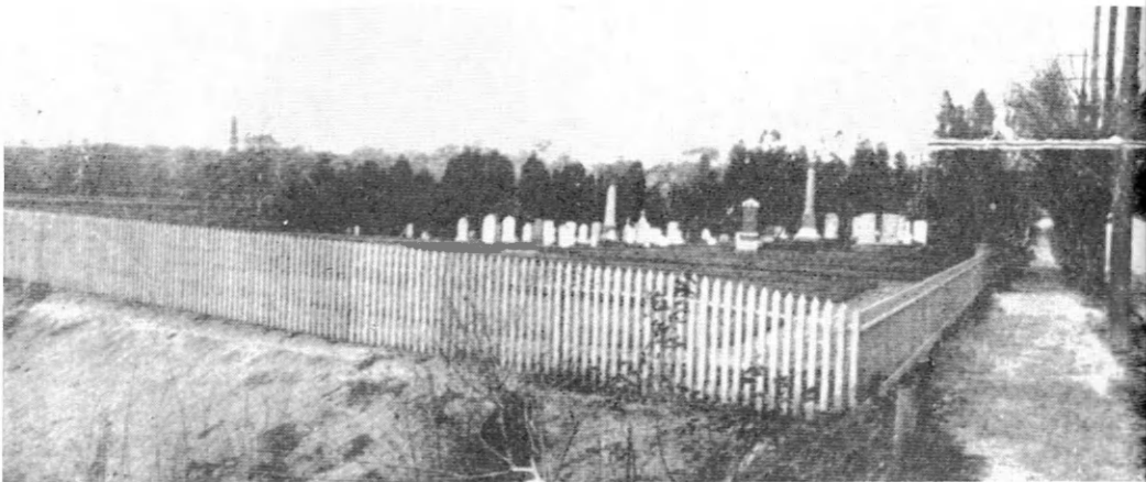
Original Cemetery, photograph taken about 1900. From a dance program in the Archives of the Congregation of the Sons of Israel and David.