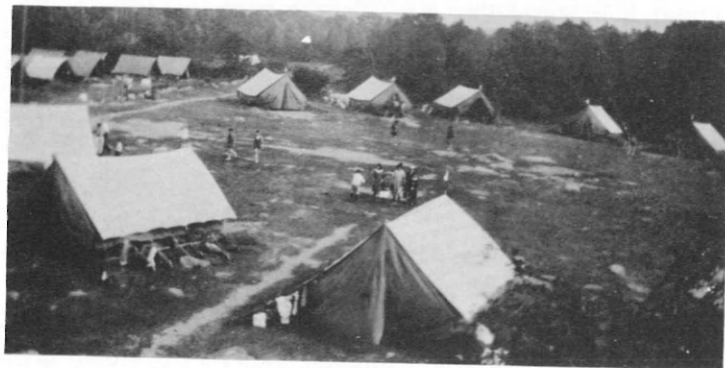
Camp Yawgoog in 1922.