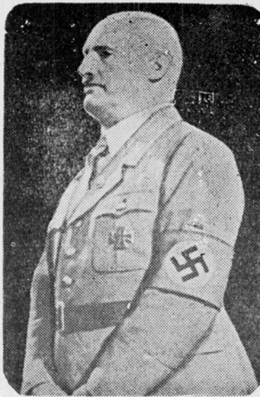
JULIUS STREICHER Has a New Bug in His Head

Berlin (WNS)—Enraged by appeals in the Roumanian Jewish press to Roumanian Jews not to buy German toys manufactured chiefly in Nuremberg, Julius Streicher, Nazi overlord of Franconia, of which Nuremberg is the capital, launched a new anti-Jewish boycott drive.