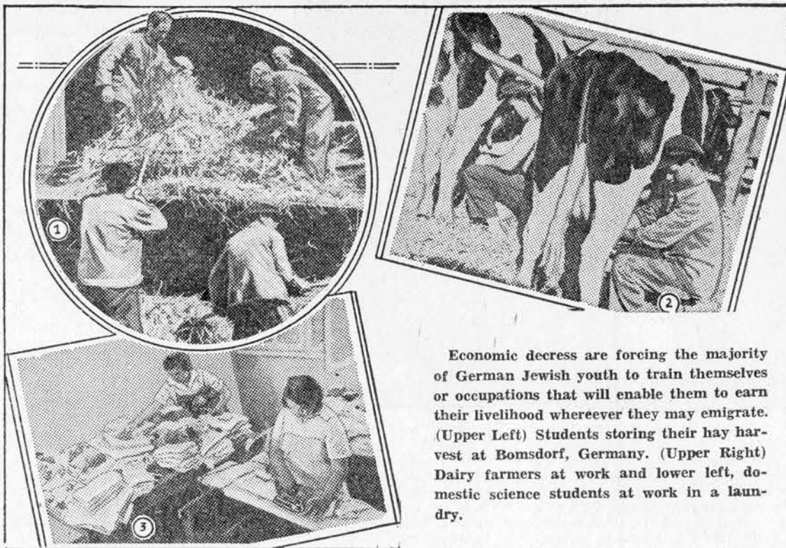
Economic decess are forcing the majority of German Jewish youth to train themselves or occupations that will enable them to earn their livelihood wherever they may emigrate. (Upper Left) Students storing their hay harvest at Bomdorf, Germany. (Upper Right) Dairy farmers at work and lower left, domestic science students at work in a laundry.