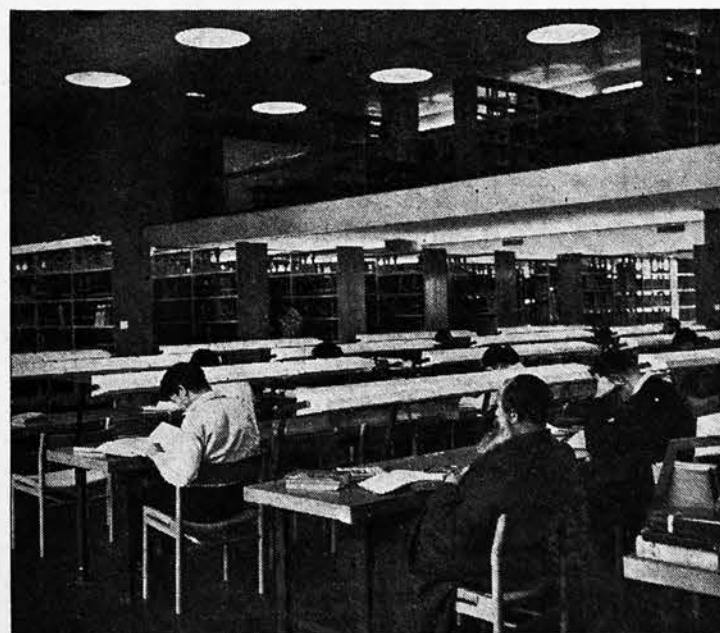
Students of all ages utilize the reading-rooms