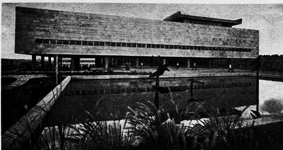
The ultra-modern University Library and the pond alongside