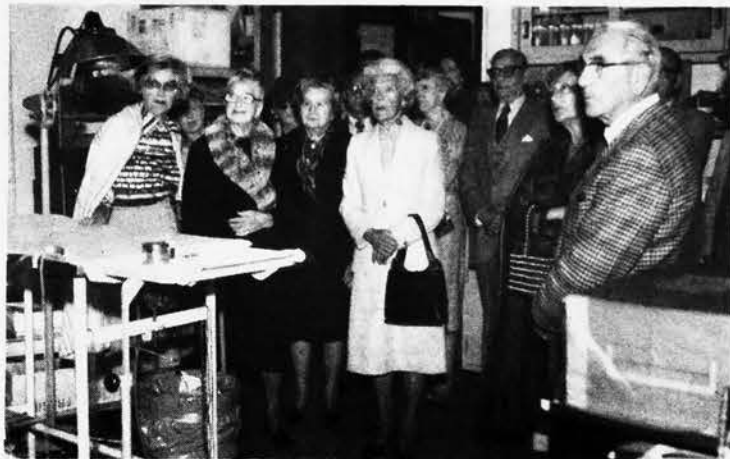
Invited guests on a tour of the Sol Koffler Research Center at the Miriam Hospital.