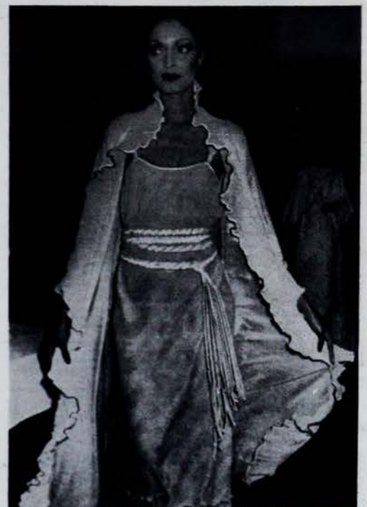
RELAX IN ELEGANCE wearing a pleated lounge dress, with satin wrap edged in pleated chiffon. Available in the fresh, cool colors of lilac, mint or peach. From Mary McFadden's, Collection I for spring/summer, 1980.

Mary McFadden—Collection I brings the art of Mary McFadden to the consumer who, before, could only dream of a McFadden in her wardrobe.