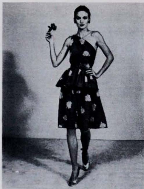
UPDATING A CLASSIC —Kasper for J.L. Sport takes the one-shouldered dress and gives it the look of today with a pepum and a new tonality—lipstick red and topaz. Of pure silk crepe de chine, it goes from day to evening with ease.

And Ethera tells us they will greet spring with lively shades of pinks, purple and luscious tones of the earth and berries. In all, the spring warmup will take us into a time of greater elegance, more precision in fashion and overall a classier approach to dressing—evenings as well as daytime.