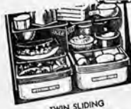
TWIN SLIDING CRISPERS

Two roomy crispers of 13 qt. capacity each, provide extra-moist storage for fruits and vegetables. Porcelain-enamelled — Extra aluminum handles. Crystal-clear glass covers show contents at a glance.