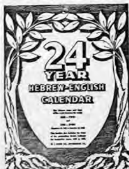
The New Edition of the Heins Calendar All dates - 1924 to 1949

To find Yahrzeit dates, Bar Mitzvahs and other anniversaries is a task of a few moments with this convenient 24-year Hebrew English calendar at hand. Jewish holidays up to the year 1965 are also listed on a special page.