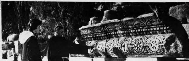
Capernaum on the Sea of Galilee