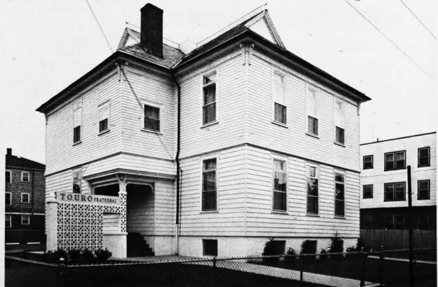
The new home of the Touro Fraternal Association at the corner of Congress and Niagara Streets.

The second floor also contains (Continued on Page 12)