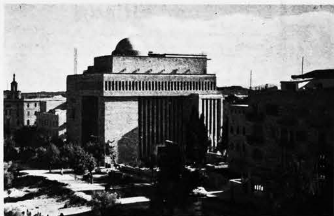
Heichal Shlomo (Chief Rabbinate) in Jerusalem