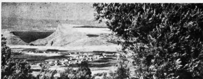
Horns of Hittin with the Sea of Galilee in background