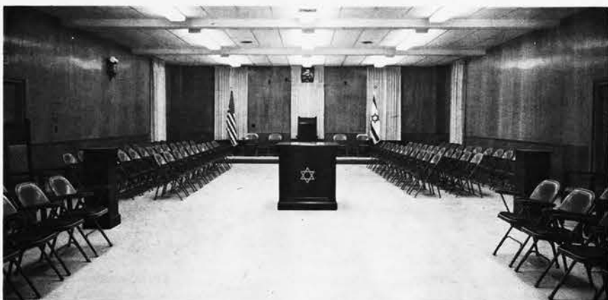
The main meeting and social hall on the first floor of the Touro building.