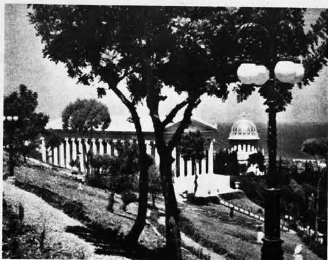
Bahai Temple, Shrine and gardens in Haifa