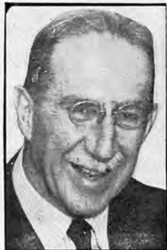
THEODORE FRANCIS GREEN For United States Senator