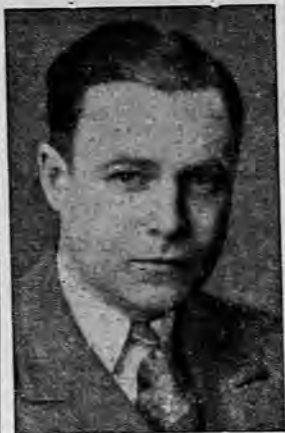
GOV. J. HOWARD McGRATH

In a message released to Rhode Island Jewry, this week at the State House, Governor J. Howard McGrath extended "sincerest wishes for a Happy and Prosperous New Year." "I am again reminded," he said further, "of the thrift and industry, of devotion to high ideals, of love for liberty and justice, of unswerving devotion to the tenets of your faith which have combined to conserve your illustrious past and light the pathway to future glorious achievement."