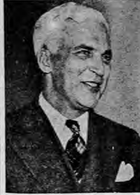
PAUL V. McNUTT

MILWAUKEE. — Paul V. McNutt, Federal Security Administrator and a past National Commander of the Legion, this week scored Lindbergh's anti-Semitic speech of last Thursday saying, "There is no effort to lead the United States into war either on the part of the government or by our Jewish citizens."